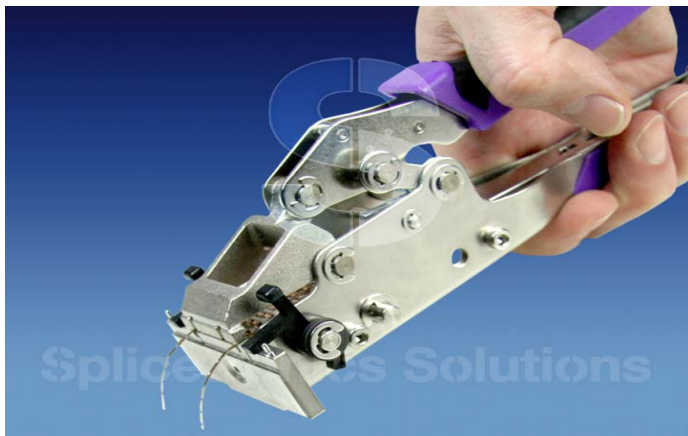
Used with Semi-Auto Splicing Tool – ST410